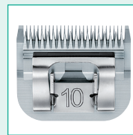
GT330 #10 1/16" | 1,5 mm