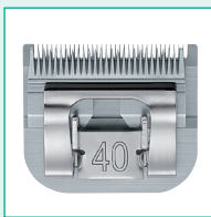
GT310 #40 1/100" | 0,25 mm