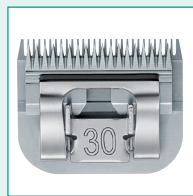
GT317 #30 1/50" | 0,5 mm