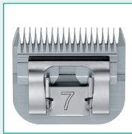
GT343 #7 1/8" | 3,2 mm