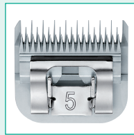
GT357 #5 1/4" | 6,3 mm