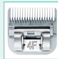
GT364 #4F 3/8" | 9,5 mm