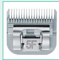
GT360 #5F 1/4" | 6,3 mm