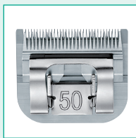
GT305 #50 1/125" | 0,2 mm