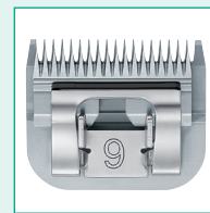
GT333 #9 5/64" | 2,0 mm