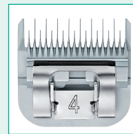
GT366 #4 3/8" | 9,5 mm