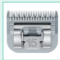
GT326 #15 3/64" | 1,2 mm